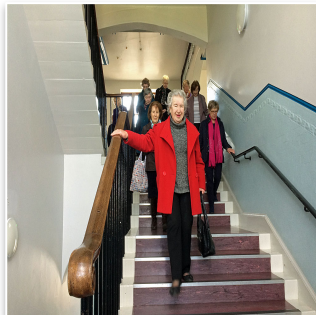
Former pupils tour the old JGHS building on Bruntsfield