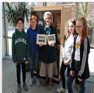
Former pupil meets current pupils of JGHS