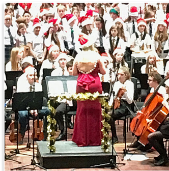
Annual JGHS Christmas Concert in the Usher Hall.